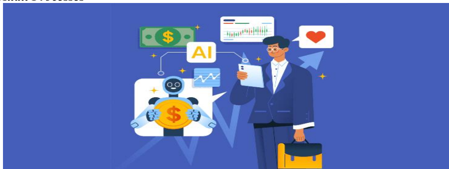
Figure 2. AI in marketing [2] [6]