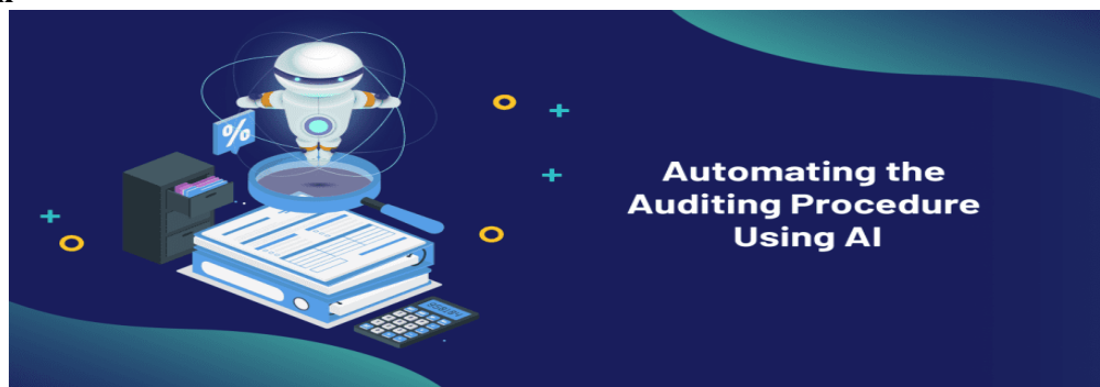
Figure 1. Automation of Audit procedures [1]

The advent of artificial intelligence (AI) has heralded a new era in various industries, and the field of auditing is no exception. The traditional audit processes, which have long been labor-intensive, time-consuming, and sometimes prone to human error, are undergoing a significant transformation. AI-driven automation is redefining the landscape by streamlining routine tasks, enhancing data collection methods, and performing preliminary analyses. This white paper delves into the transformative impact of AI on audit processes and explores how these advancements are enabling auditors to focus on more complex and judgment-based tasks.